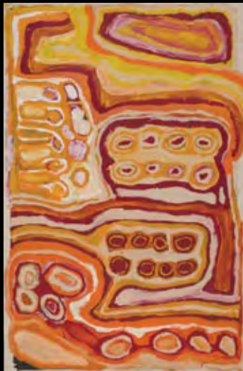
6 Kunawarritji , 2007, by Nora Wompi, Martumili Artists, National Museum of Australia

The Canning Stock Route was surveyed and wells constructed between 1906 and 1910. From 1911 to 1931 only eight mobs of cattle were driven from stations such as Billiluna and Sturt Creek to Wiluna. By 1917 half of the wells had been damaged or destroyed. In 1929 a project commenced to rebuild the wells. The years 1932 to 1959 saw a new era of droving along the stock route. Many artists painting today were growing up in the desert during this period.