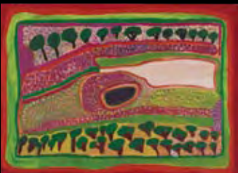
3 Tapu Country , 2008, by Jukuna Mona Chuguna, Mangkaja Arts, National Museum of Australia