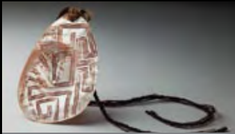
9 Engraved jakuli , about 1930, collected by Alfred Canning's party, South Australian Museum