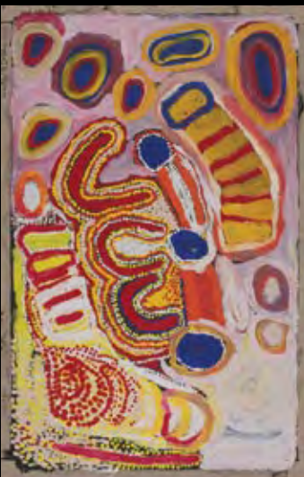
4 Kumpupirntily , 2007, by Jakayu Biljabu and Dadda Samson, Martumili Artists, National Museum of Australia