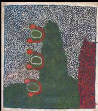
7 Kulyayi , 2007, by Jewess James, Ngurra Artists, National Museum of Australia