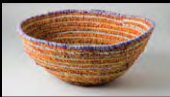
10 Basket, 2009, by Kumpaya Girgaba, Martumili Artists, National Museum of Australia