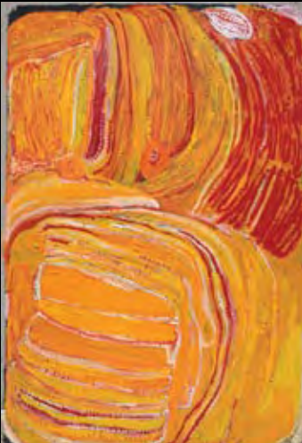
2 Kinyu , 2007, by Eubena Nampitjin, Warlayirti Artists, National Museum of Australia