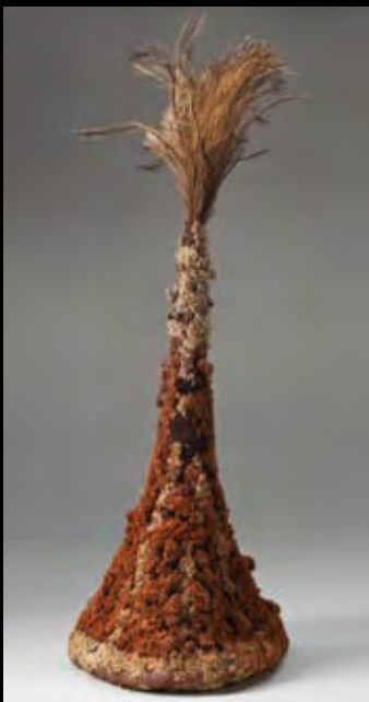
11 Pukurti (tall Majarrka headdress), 2007, by Ned Cox, Ngurra Artists, National Museum of Australia