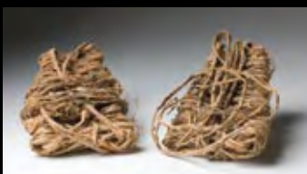
12 Yakapiri (bark sandals), 2008, by Penny K-Lyons, Mangkaja Arts, National Museum of Australia