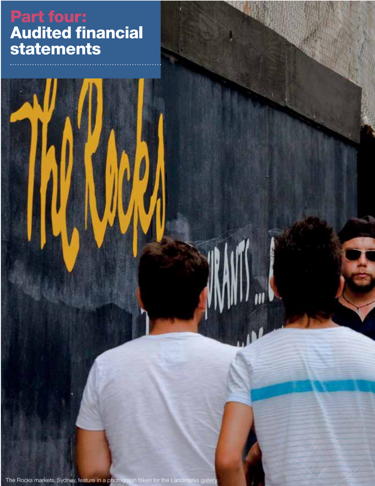
The Rocks markets, Sydney, feature in a photograph taken for the Landmarks gallery.