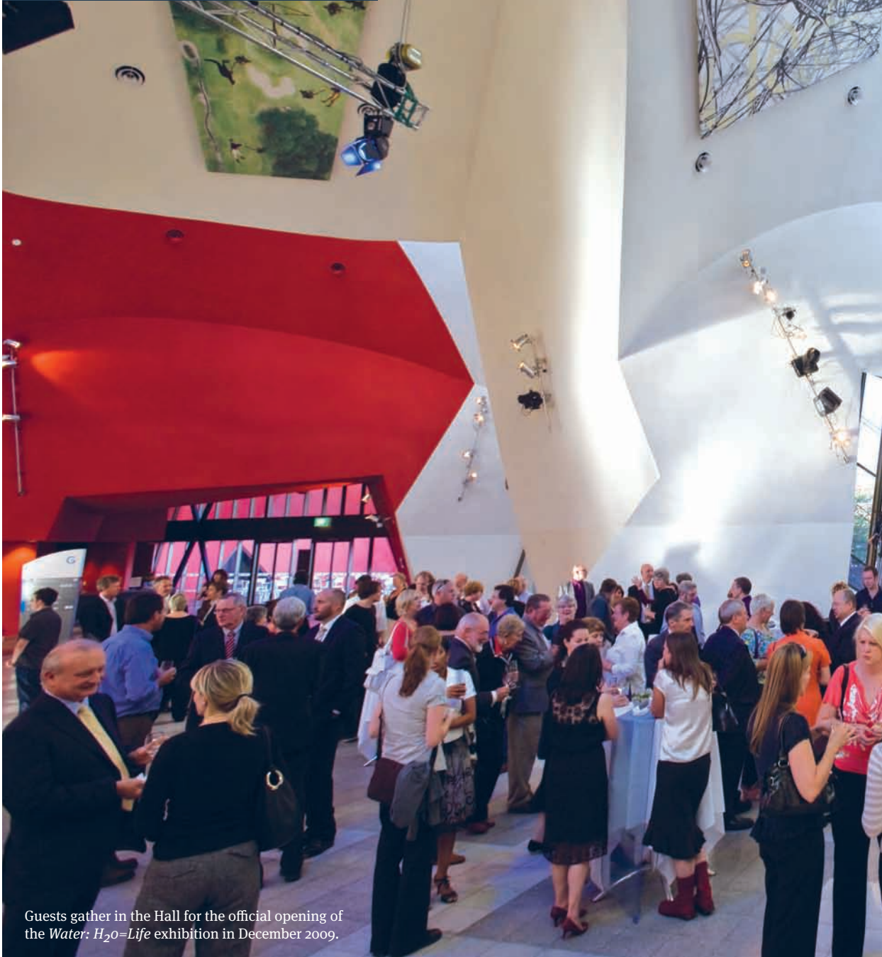
Guests gather in the Hall for the official opening of the Water: H 2 O=Life exhibition in December 2009.