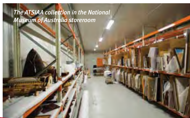
The ATSIAA collection in the National Museum of Australia storeroom