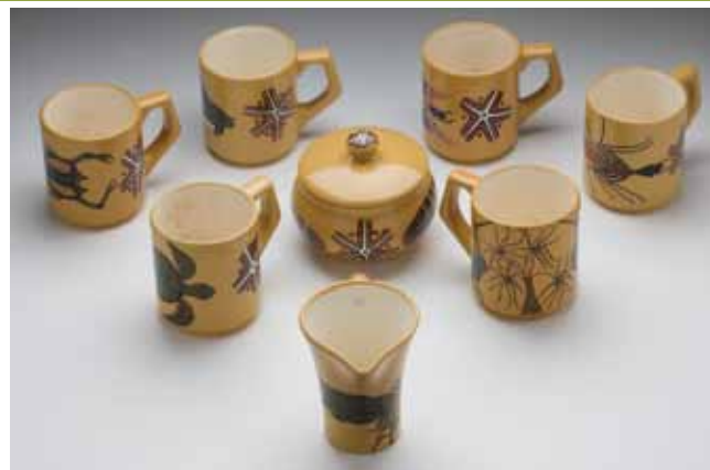
Coffee set with ATSIC logo from the ATSIC office in Nhulunbuy

that these bodies did acquire many artworks over a 38-year period. There was no specific budget put aside for buying artworks. However, towards the end of the financial year, if there was any money left unspent, then artworks were bought. In fact, it had been an unofficial policy that only paintings and objects by Aboriginal and Torres Strait Islander peoples would be displayed in the offices.