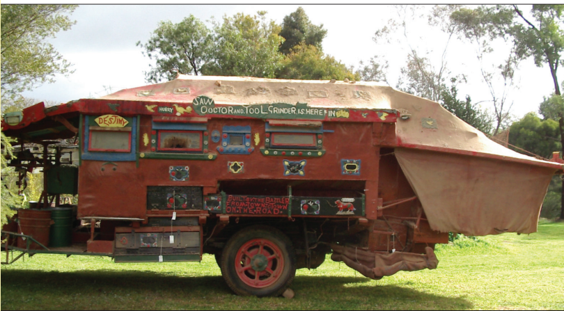
The Road Urchin, also known as the Saw Doctor's Wagon.