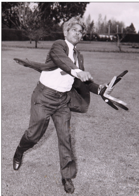
Neville Bonner throwing boomerangs in the Senate Gardens, Canberra, August 1971.