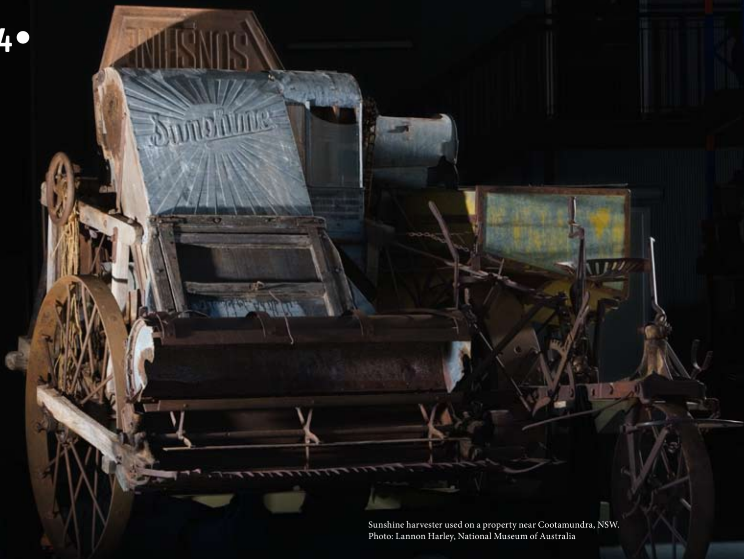
Sunshine harvester used on a property near Cootamundra, NSW.

McKay's harvester company expanded rapidly. By the early years of the new century, it was apparent that a new factory site was needed. In 1904 McKay purchased the Braybrook Implement Works and surrounding four acres of land for £3651. The Braybrook site offered McKay room to expand his burgeoning agricultural implements factory. There was ready access to multiple railway lines, to supply both McKay's domestic and international customers. As Braybrook was in a shire, it did not fall under the control of the Wage Boards, and so offered McKay protection from that system.