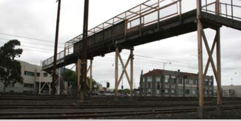
Left: Footbridge with the 1927 factory offices on the right. Below: Bulk Store, built in 1924 and one of the last remaining buildings of the Sunshine Harvester Works.