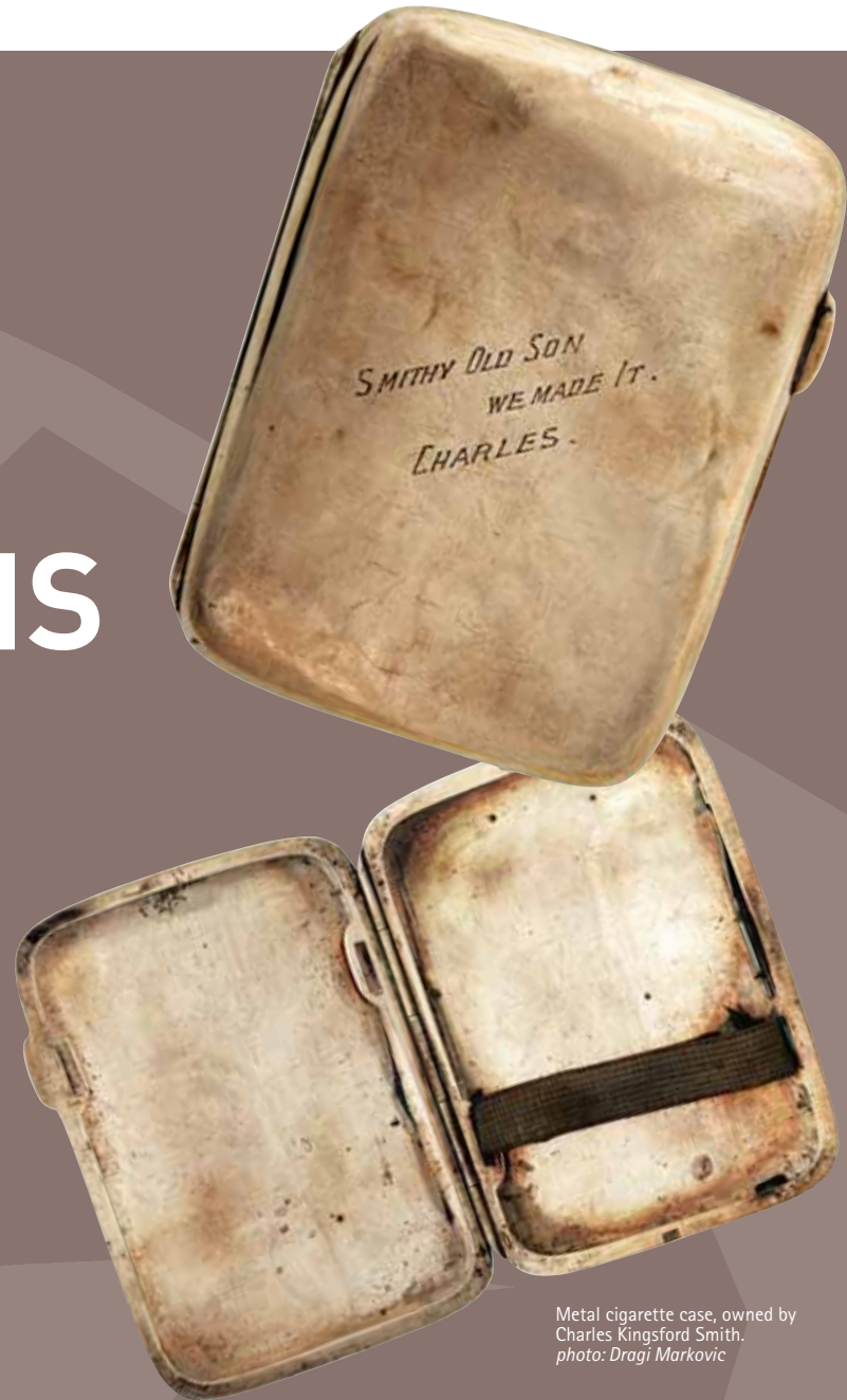
Metal cigarette case, owned by Charles Kingsford Smith.

In the mid-1920s he changed course and began to fly for records and firsts with his flying companion Charles Ulm. In 1928 they went to America attempt for one of the big 'firsts' — a flight across the Pacific. Smithy, Ulm and two Americans made the inaugural flight from the United States to Australia in the now-legendary Southern Cross. That flight made Smithy the hero of Australia. More than Bradman and Phar Lap and Nelly Melba, he was the unequalled Australian superstar. Every moment of the flight seemed to be turned over in the press, and Ulm's flight logs were published. Even the scribbled notes they wrote mid-flight were newsworthy. One, from Ulm to Smith, read: 'I've got a